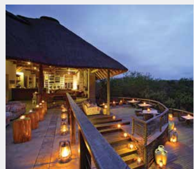
TABLE OF FACTS