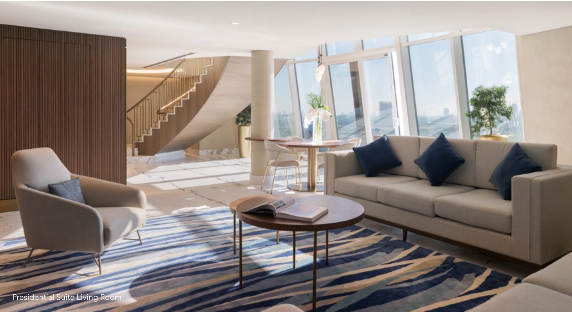
Presidential Suite Living Room