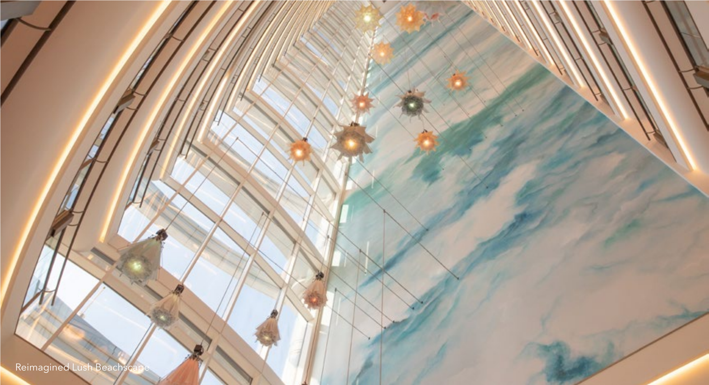
Reimagined Lush Beachscape