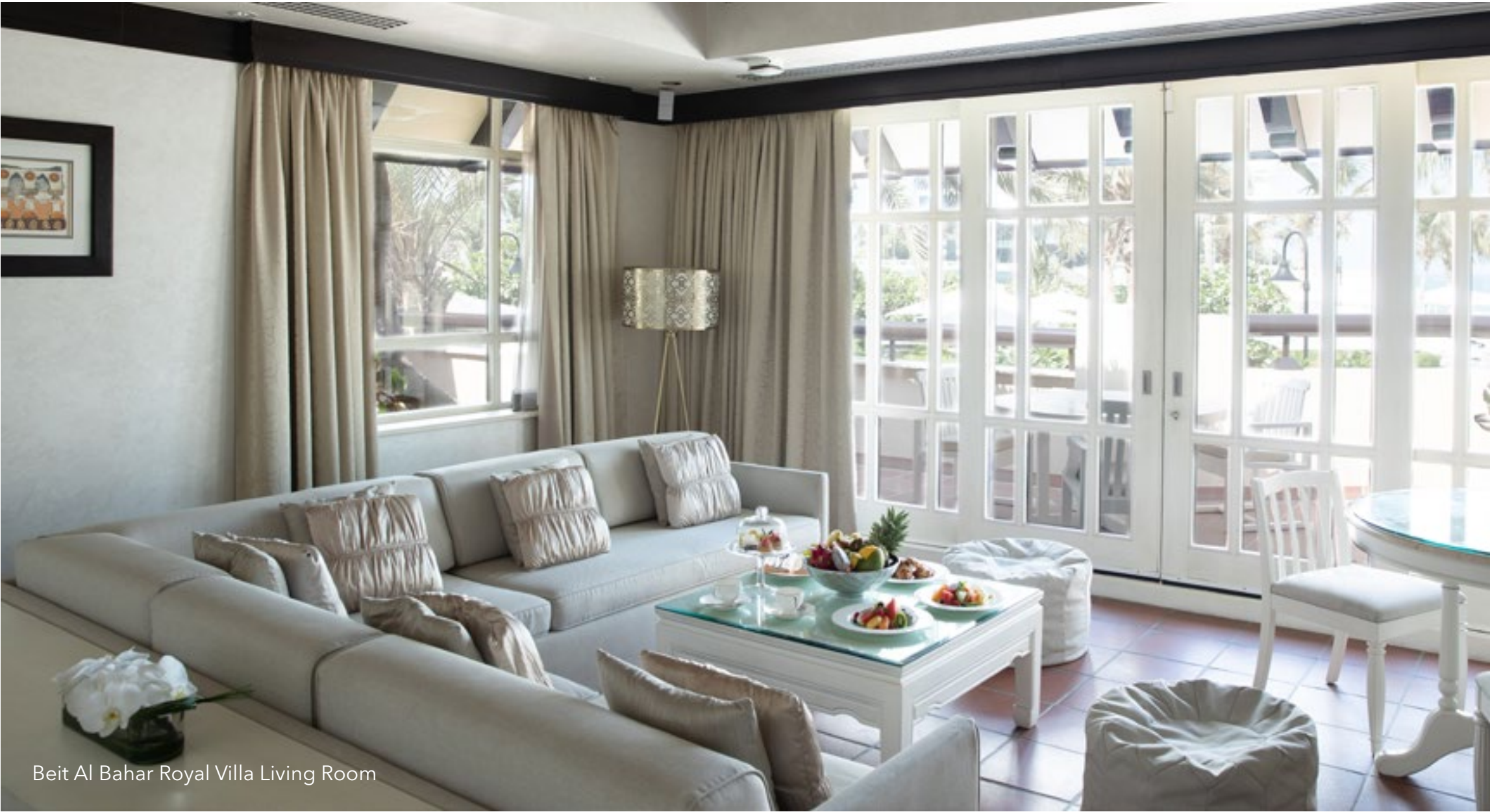
Beit Al Bahar Royal Villa Living Room