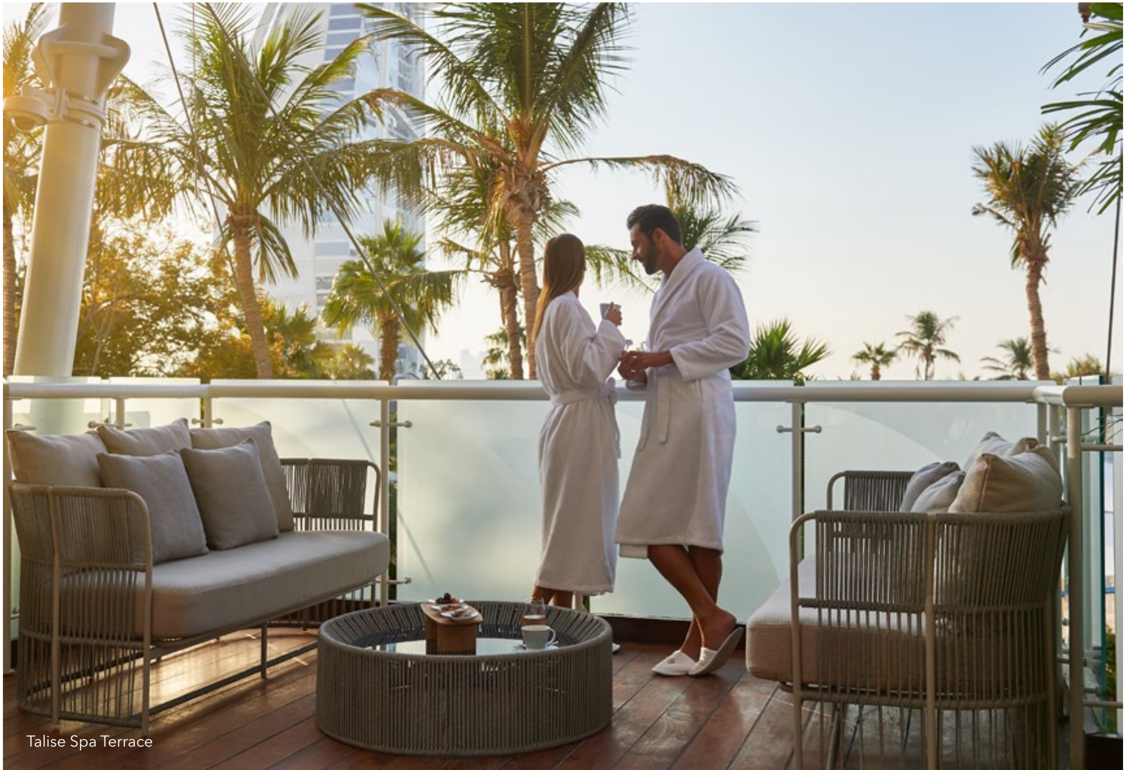
Talise Spa Terrace