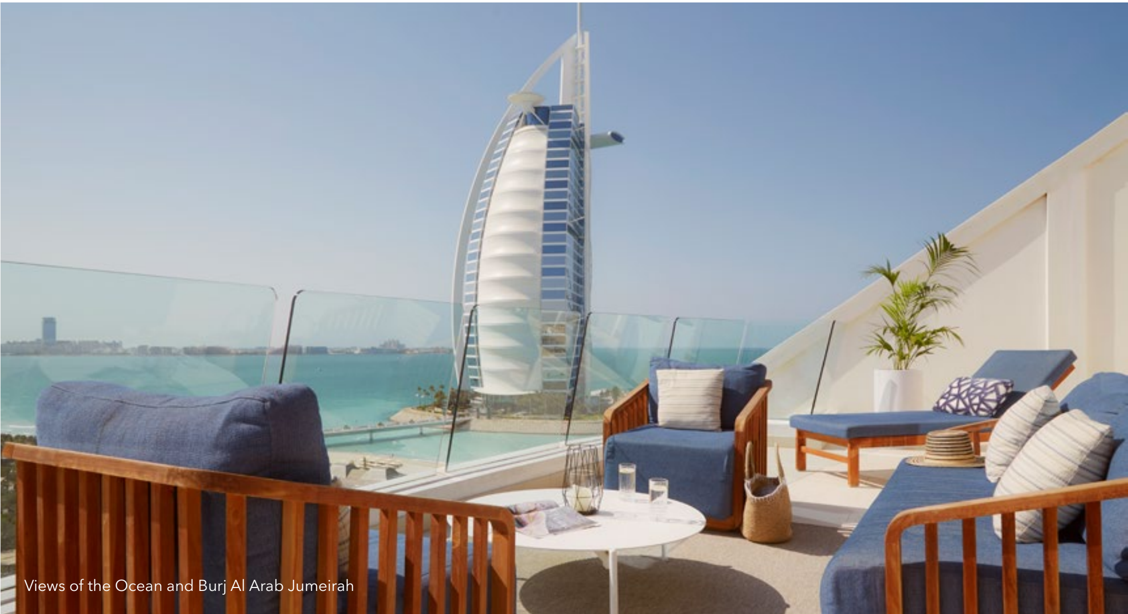
Views of the Ocean and Burj Al Arab Jumeirah