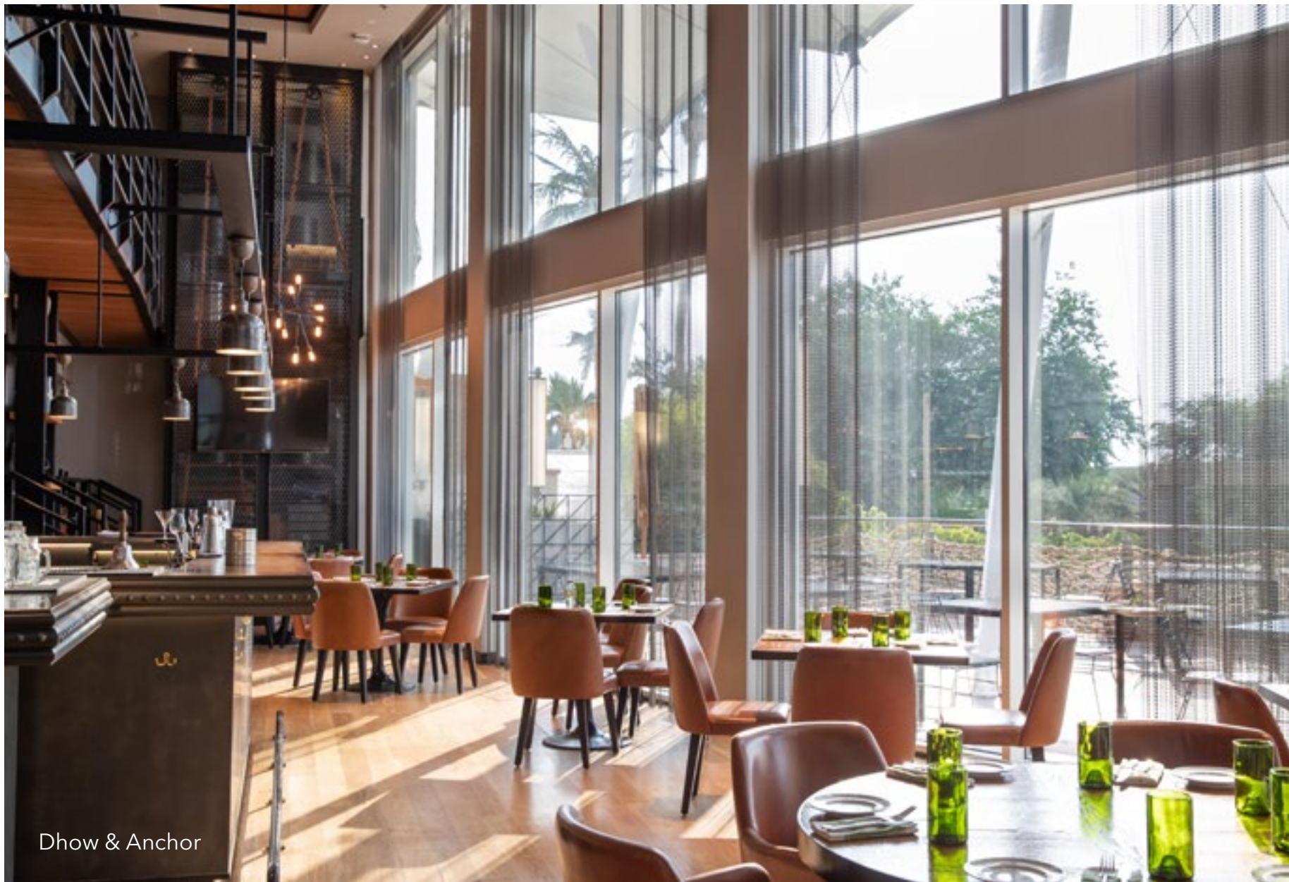
Dhow & Anchor

The classic gastropub Dhow & Anchor brings British culture and food to Dubai. It is loved by British expats looking for a nostalgic reminder of home as well as holidaymakers in search of quality British food and entertainment. It is also a popular destination for ladies' night, watching live sporting action and weekly quiz nights.