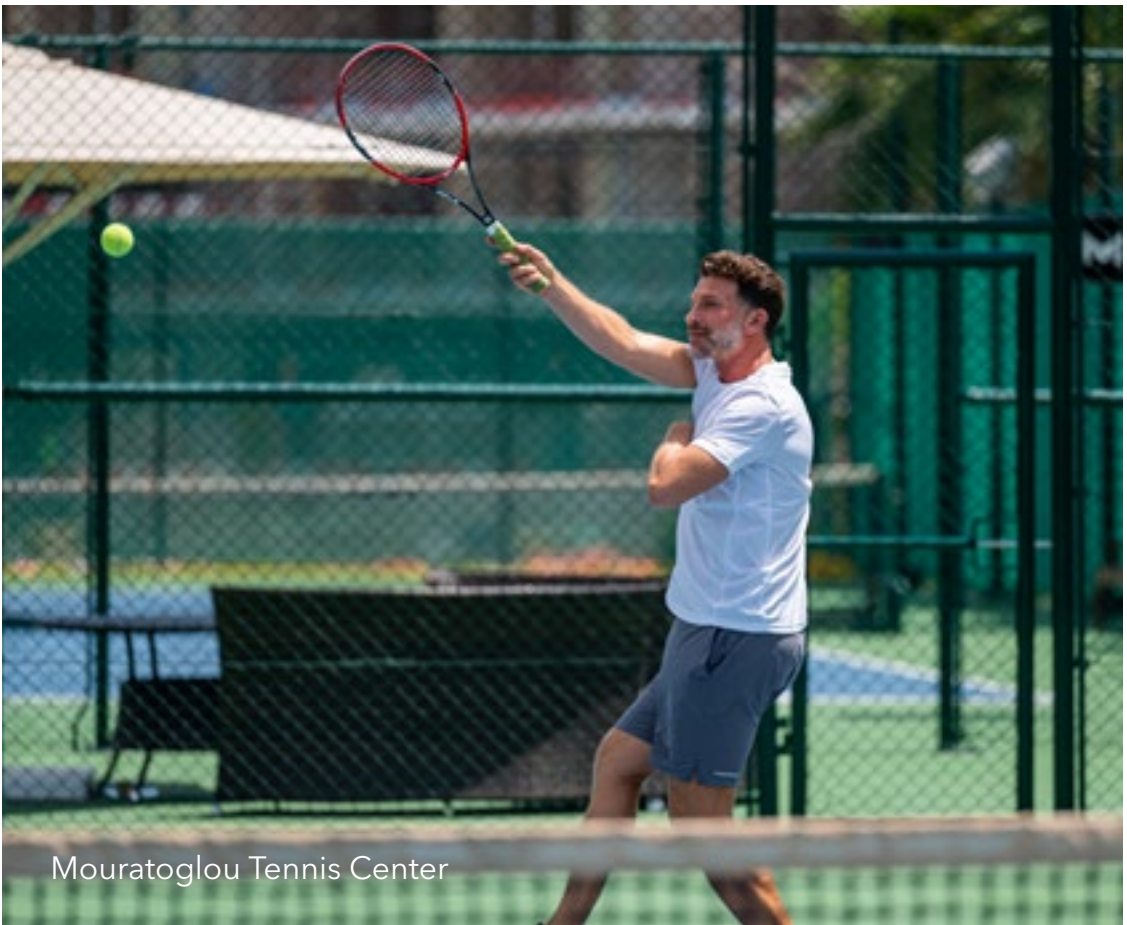
Mouratoglou Tennis Center