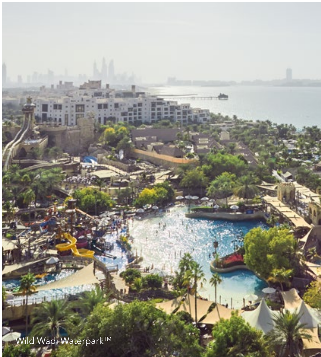
Wild Wadi Waterpark™